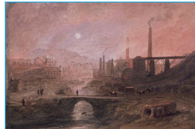
Nantyglo Ironworks, 1829

Leave the car park by the narrow exit into the Market Square. Once in the square Baileys Llangattock Tramroad divided into two. The left branch runs almost at right angles down Station Road heading for ‘Limestone Road’ and the ironworks.