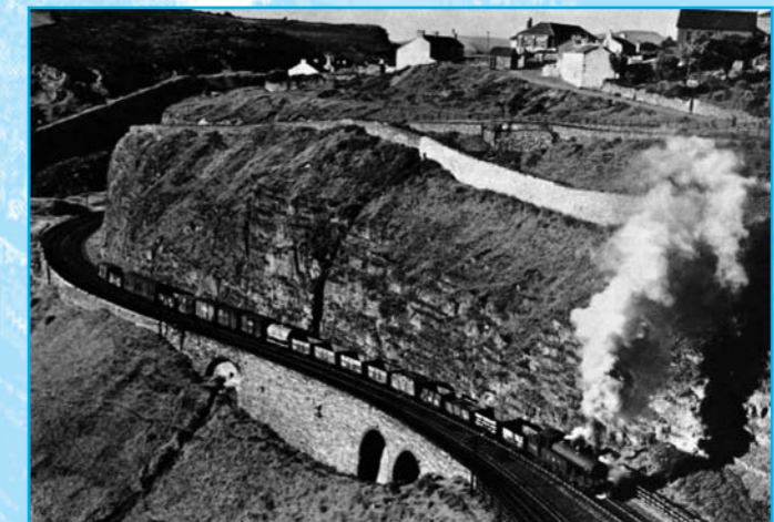
MT & A Railway

After about 300m, you will see a lay-by on the opposite side of the A465. Here you will see the Clydach Coal Levels, opened in 1812 to supply coal for sale in Abergavenny. One entrance is a cave-like opening in the side of the gorge; the other has a stone arch built at the time of the Merthyr, Tredegar and Abergavenny (MT & A) Railway in the 1850s and 1860s.